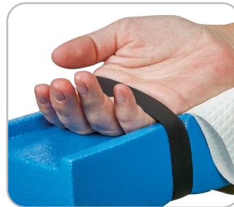
Seamless, wipeable hand loop for security