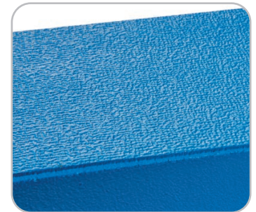
Nonskid base for stability